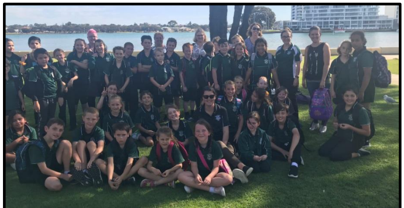
Our Year 3/4 and 4/5 students went on an excursion to see The 78 Storey Treehouse at the Mandurah Performing Arts Theatre