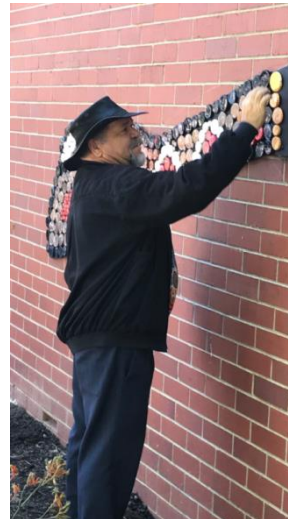
Djilba August, September