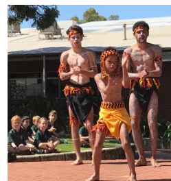
Kambarang October, November