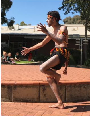
Makuru June July