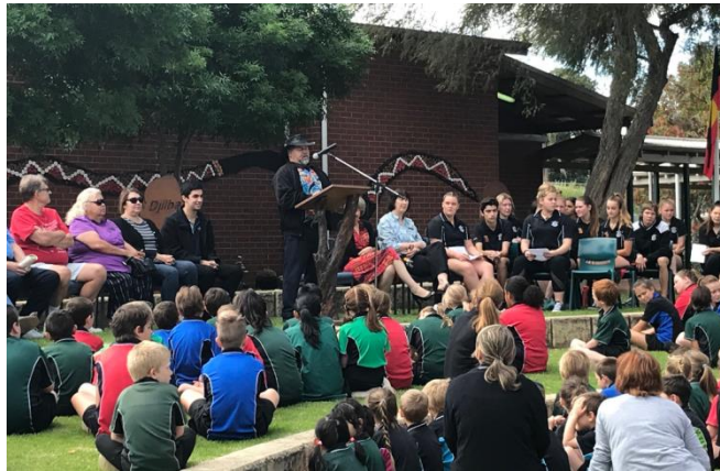
Djeran April, May