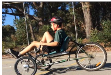
Our Pedal Prix group testing out their creation