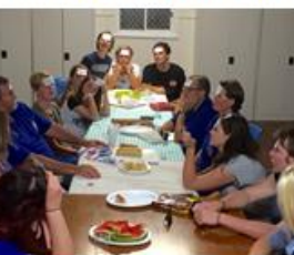
PLAYING FUN GAMES