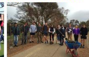
REPLANTING AFTER THE FIRES