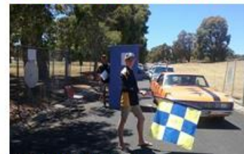
THE AMAZING RACE

HERE ARE SOME OF THE GREAT THINGS THAT WE DO?