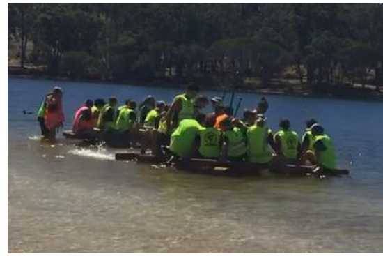
Last week our Year 7 & 8 students were at the Waroona Weir where they were given materials and guidance of how to build a raft that would accommodate the whole team. There were a few "obstacles" which created a great deal of chaotic fun as they checked out their handy skills craftsmanship.