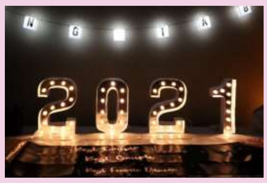
School Dance Proudly organised by our Student Council