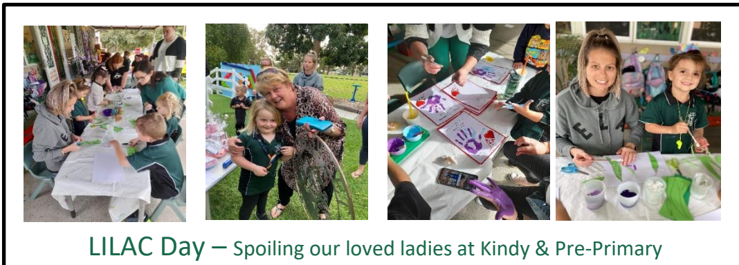
LILAC Day – Spoiling our loved ladies at Kindy & Pre-Primary