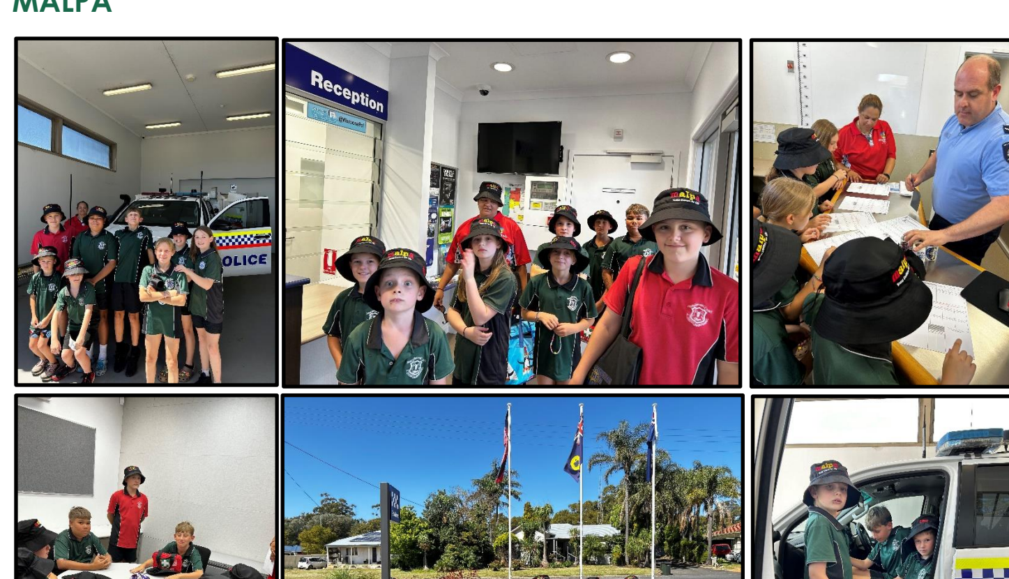
Students who are part of our MALPA programme recently went on an excursion to our local Waroona Police Station